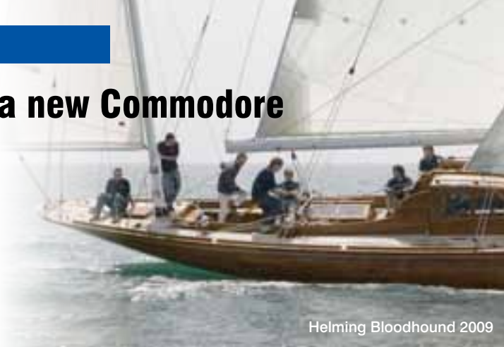
Helming Bloodhound 2009

I guess as I am your new Commodore, those who do not know me well may wonder who I am and how I would like the Club to develop during my time as your glorious leader.